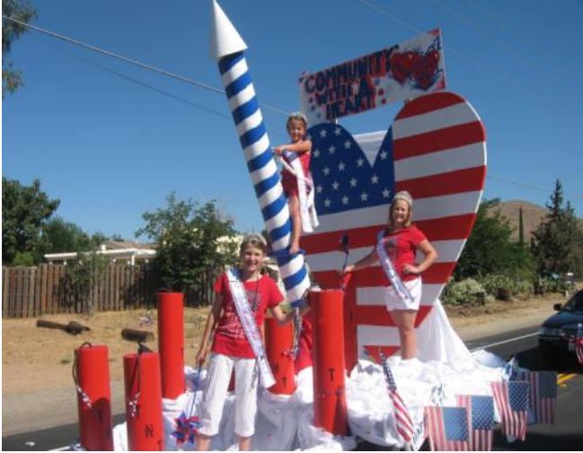
The Queens, with help from their families, took another first place in a Parade Float.