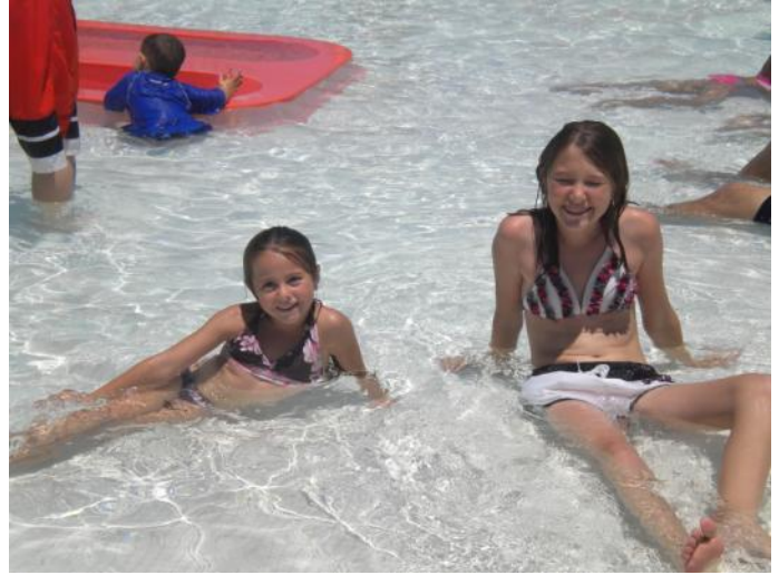
It was not really that dry at Drytown Water Park!