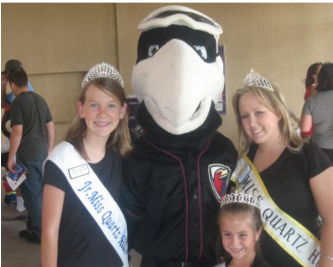
The Queens make friends with KaBoom, the Chief JetHawk!