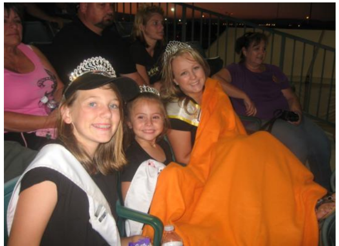
and they huddled together at the Hangar, JetHawks Stadium.